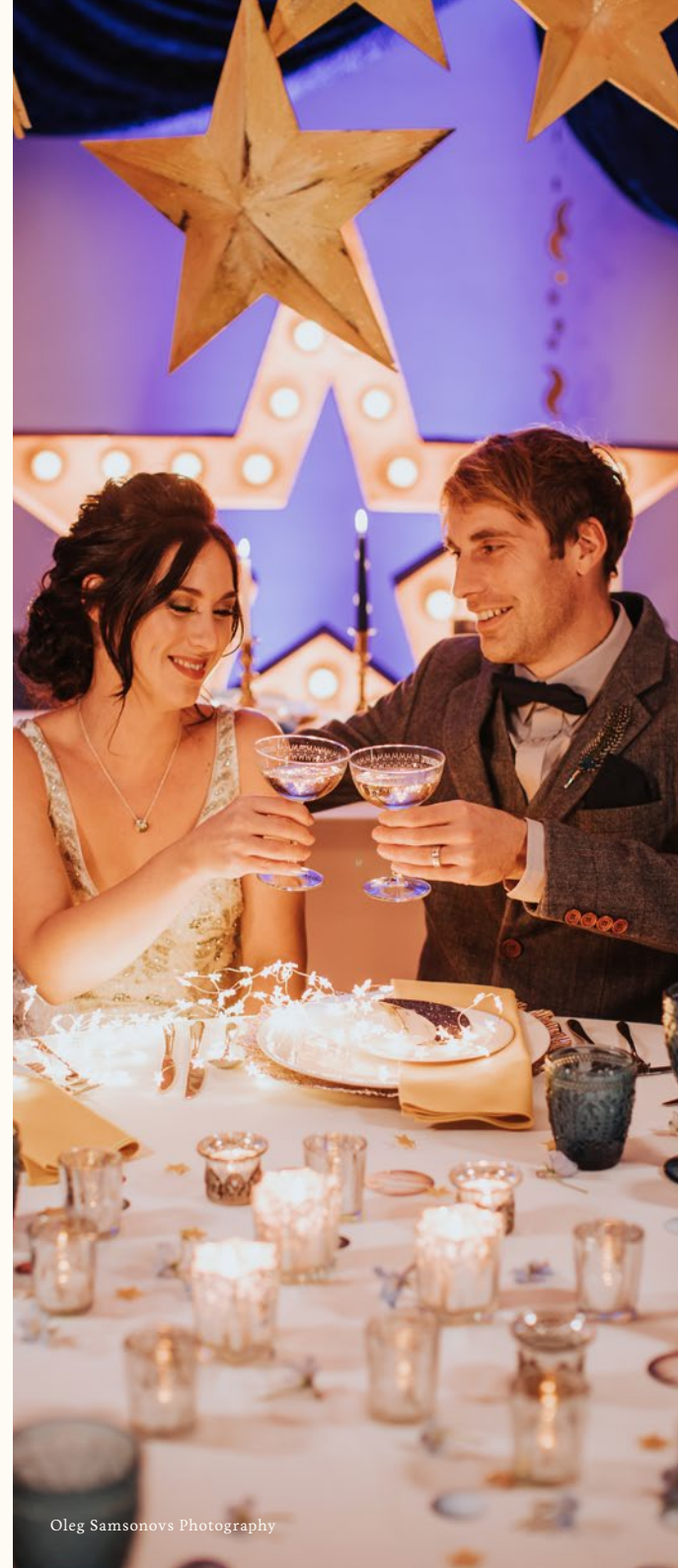
Oleg Samsonovs Photography