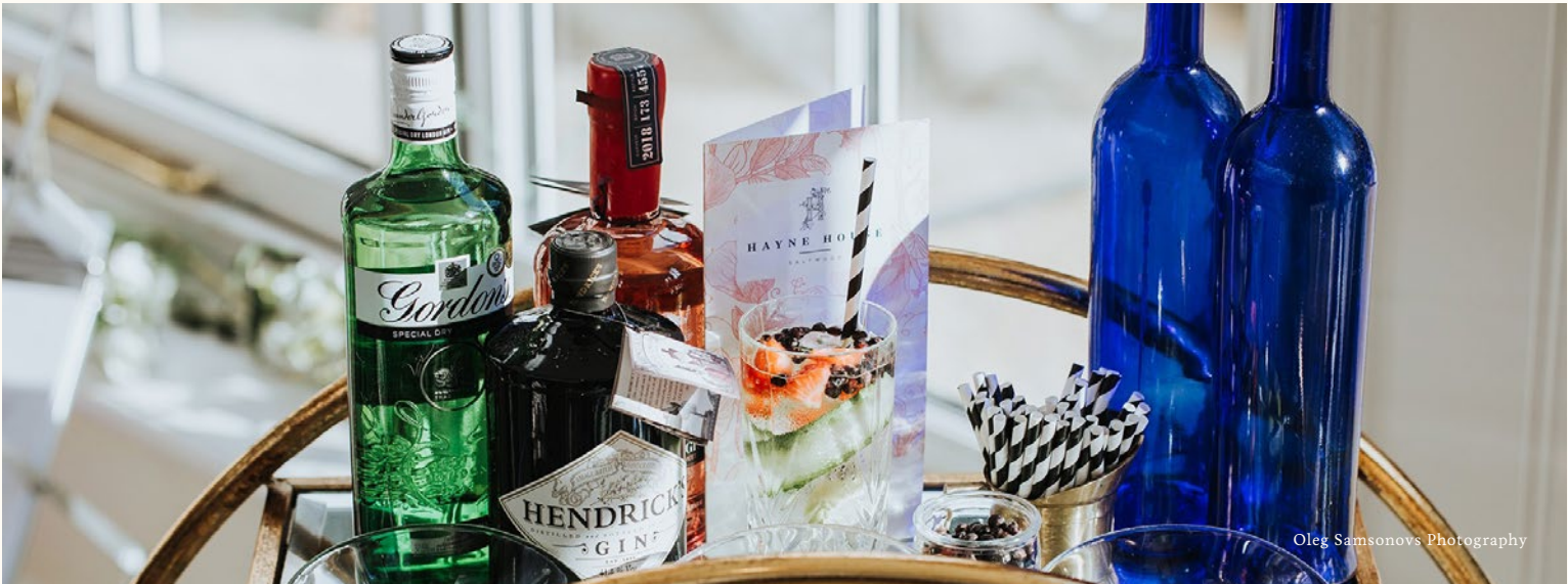
Oleg Samsonovs Photography