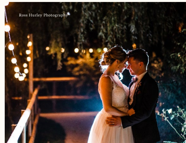
Ross Hurley Photography