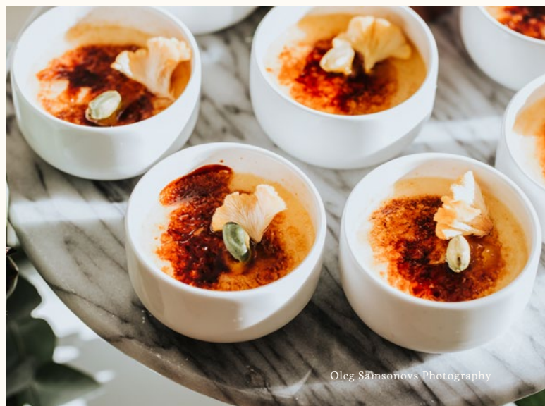
Oleg Samsonovs Photography

“We couldn't have asked for anything more. Your support and communication throughout was outstanding”