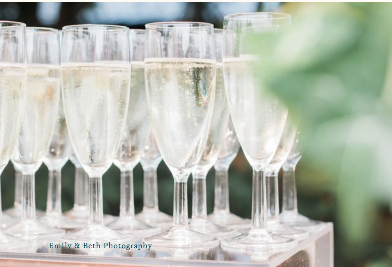
Emily & Beth Photography

We understand your choice of wedding drinks is really important to set the tone for your day. We have taken the time to create an extended list of drinks and packages, including a wonderful selection of Kentish wines and some fun additions, such as gin bars or signature cocktails.