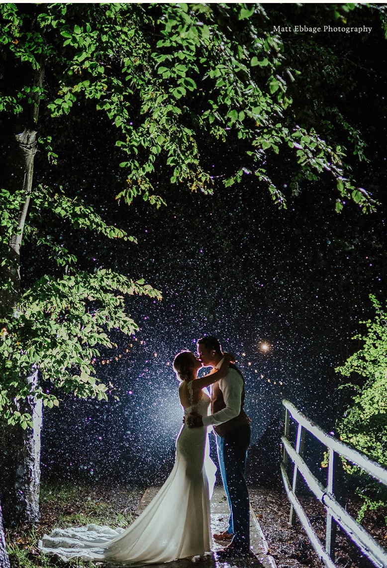
Matt Ebbage Photography